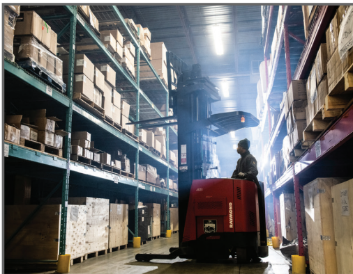
Parts and Distribution

Address: 305 N Frisco Street, Winters TX 79567 Phone: 325-812-2260