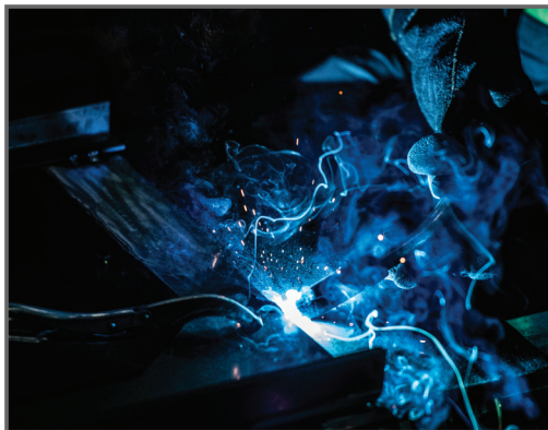
Custom Manufacturing & Fabrication