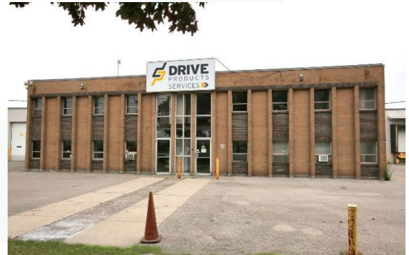
256 South Service Rd, Stoney Creek, ON L8E 2N9

The new facility will also bring added capacity and enhanced support for the regional and national customers in the market segments we serve today such as Utilities, Construction Fleet, Equipment Rental, Bulk Transport, Building Supply, and many more... Coinciding with the company's mission to provide premium quality solutions, products and services from the best people in the industry...the new facility is aimed to enhance the customer experience and support for new product lines such as Versalift Aerials, Posi+ Cable Placers, Stellar Mechanics Bodies & Cranes and existing products such as HMF Cranes, Jerr-dan Tow & Recovery, Kargo King Roll-Offs, Voth Truck Bodies, SwapLoader Hooklifts, Sterling Beavertails, Muncie PTO's & Hydraulics, Gardner Denver, Permco and Tulsa Winch.