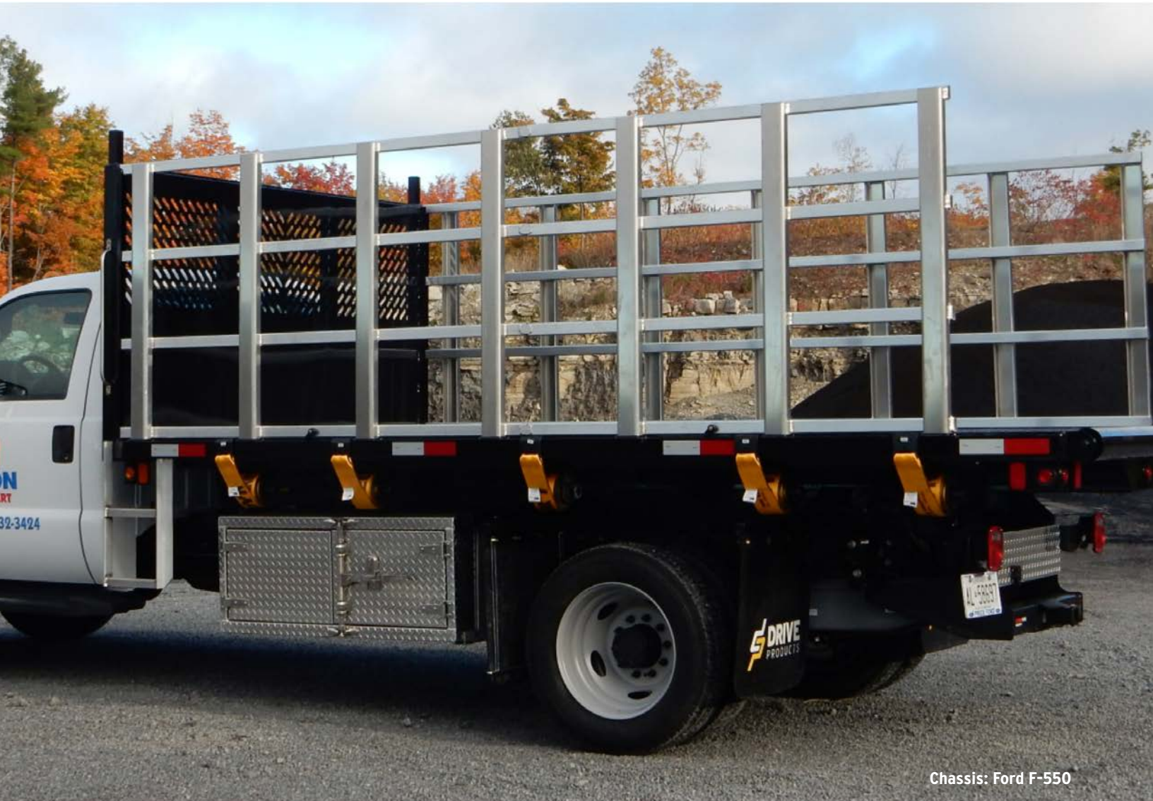
Chassis: Ford F-550