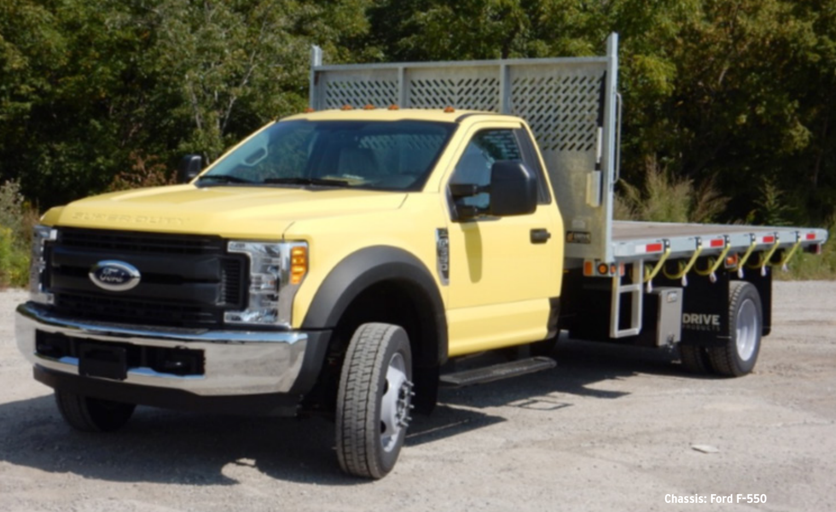
Chassis: Ford F-550