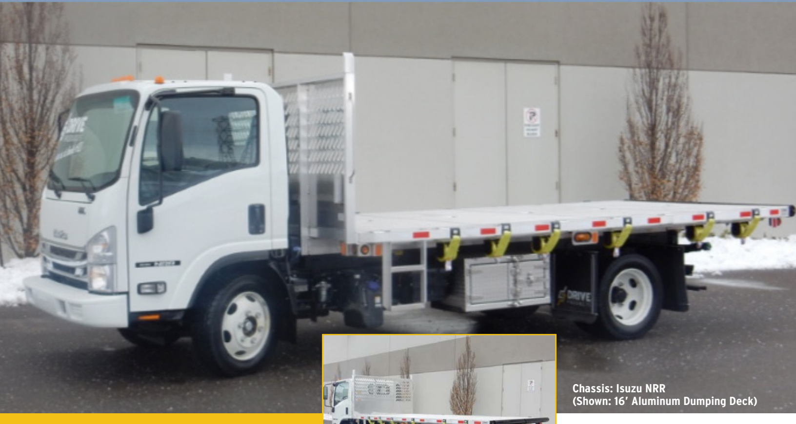
Chassis: Isuzu NRR (Shown: 16' Aluminum Dumping Deck)