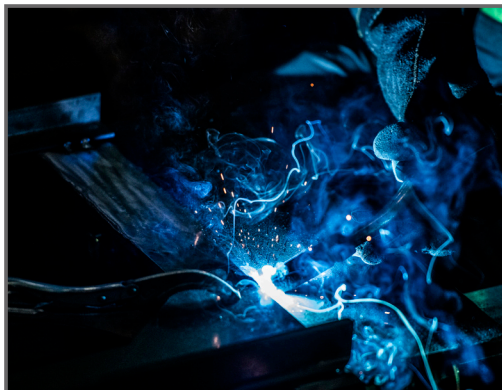
Custom Manufacturing & Fabrication