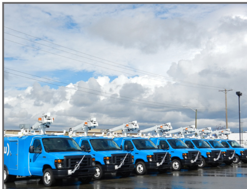
National Fleet Services

Address: 305 N Frisco St. Winters, TX Building Size: 120,000 sq. ft. Shop Sq. Ft.: 100,000 sq. ft.