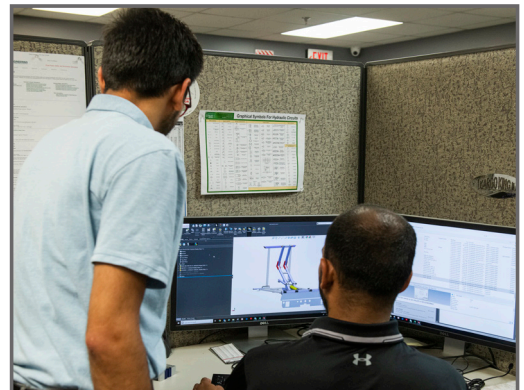
Design & Engineering