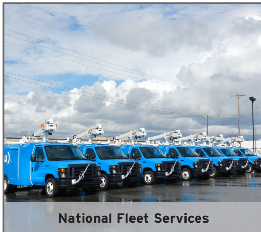
National Fleet Services

Address: 305 N Frisco St. Winters, TX Building Size: 120,000 sq. ft. Shop Sq. Ft.: 100,000 sq. ft.