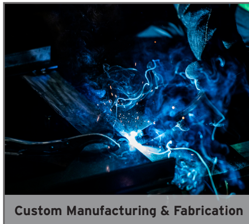
Custom Manufacturing & Fabrication