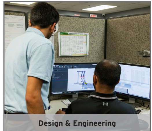
Design & Engineering