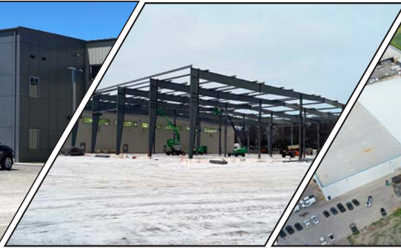
TILLSONBURG EXPANSION PROGRESS