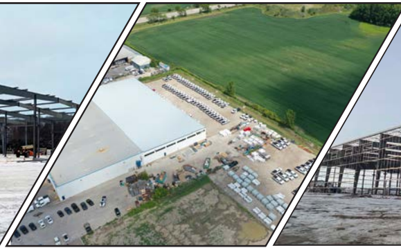
MORDEN EXPANSION PROGRESS