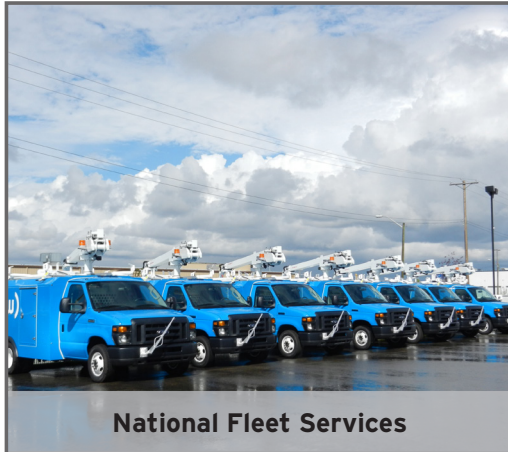
National Fleet Services

Address: 305 N Frisco St. Winters, TX Building Size: 120,000 sq. ft. Shop Sq. Ft.: 100,000 sq. ft.