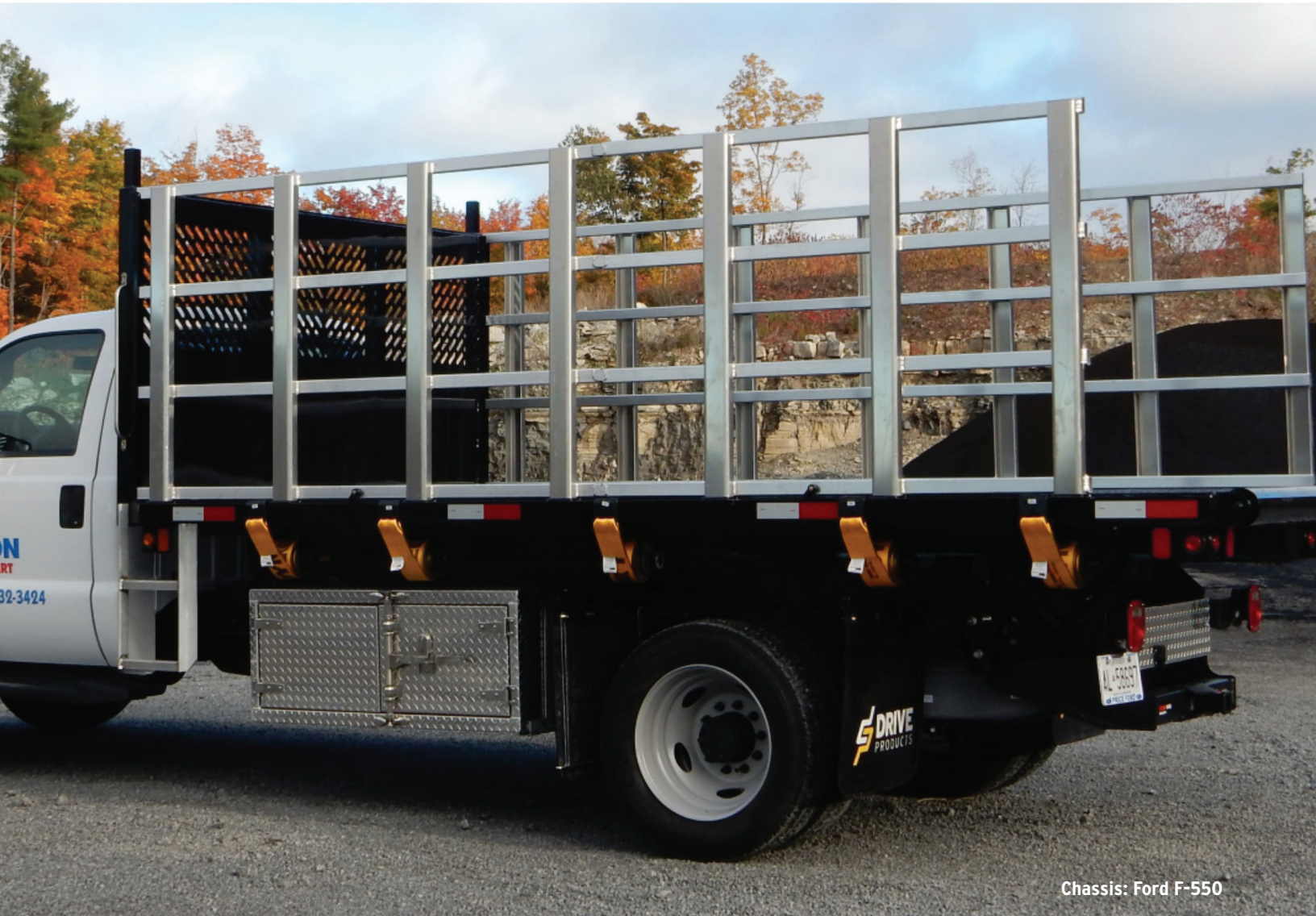
Chassis: Ford F-550