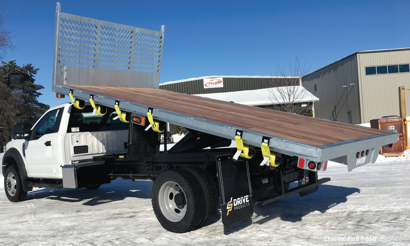
Chassis: Ford F-550