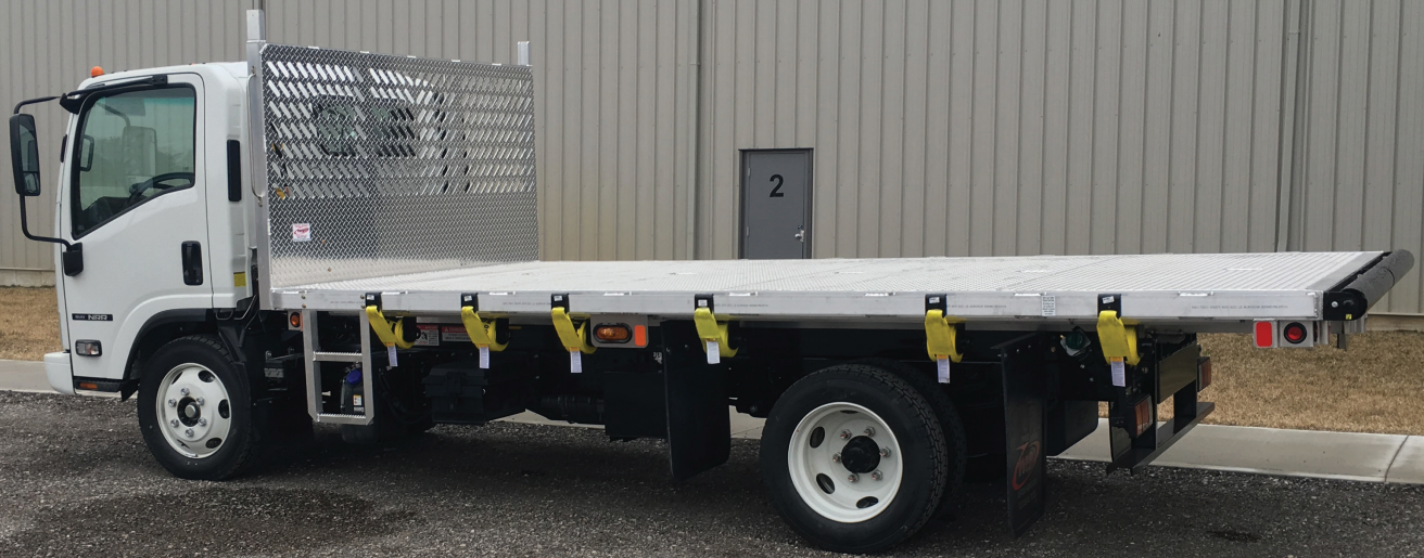
Chassis: Isuzu NRR (Shown: 16' Aluminum Dumping Deck)