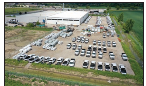
Windsor Manufacturing Facility: 85,000 sq. ft

Voth Truck Bodies serves Canada and the U.S. with steel, aluminum, and hybrid truck bodies. Supporting a variety of industries, Voth has built a strong relationship with the landscape and tree care industries with their unibody dump body design and a range of chipper body and forestry body designs. A member of Drive Products Manufacturing, Voth Truck Bodies are now manufactured in three facilities across Canada. In addition to Voth's signature line of truck bodies, these facilities also manufacture Kargo King Roll-Off Systems, Big Max Roll-Off Systems and more.