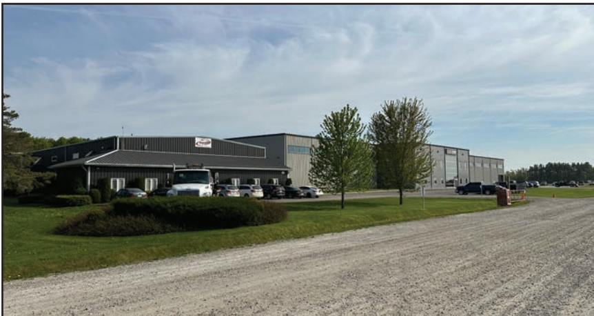
Voth Courtland Manufacturing Facility: 92,000 sq.ft