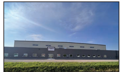
Morden Manufacturing Facility: 56,000 sq. ft