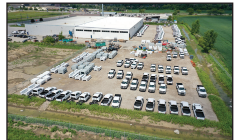
Windsor Manufacturing Facility: 85,000 sq. ft

Voth Truck Bodies serves Canada and the U.S. with steel, aluminum, and hybrid truck bodies. Supporting a variety of industries, Voth has built a strong relationship with the landscape and tree care industries with their unibody dump body design and a range of chipper body and forestry body designs. A member of Drive Products Manufacturing, Voth Truck Bodies are now manufactured in three facilities across Canada. In addition to Voth's signature line of truck bodies, these facilities also manufacture Kargo King Roll-Off Systems, Big Max Roll-Off Systems and more.