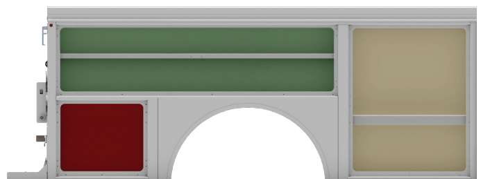
STANDARD CONFIGURATION B