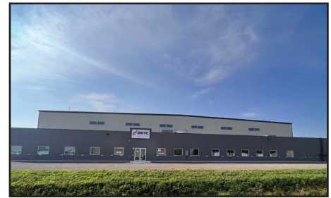
Morden Manufacturing Facility: 56,000 sq. ft