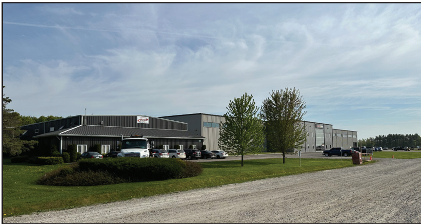
Voth Courtland Manufacturing Facility: 92,000 sq.ft